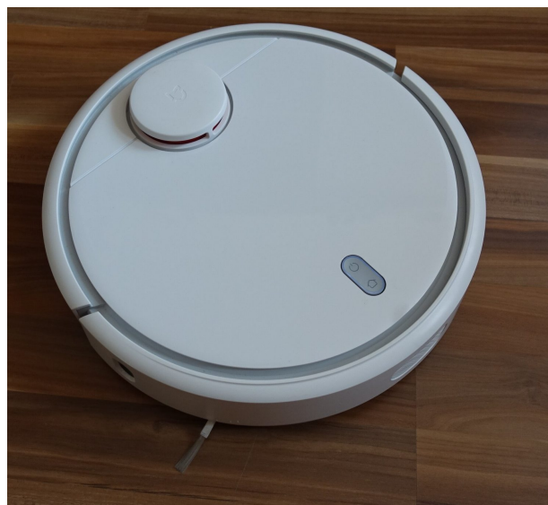
A robot vacuum cleaner: a home robot that drives itself around to clean the floor