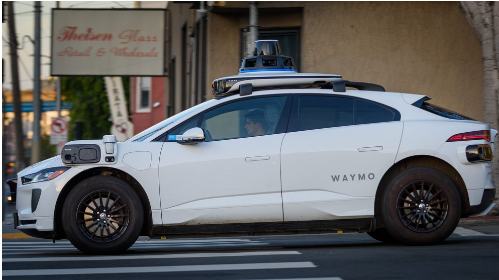
A self-driving car: sensors on the car let a computer steer it with no driver