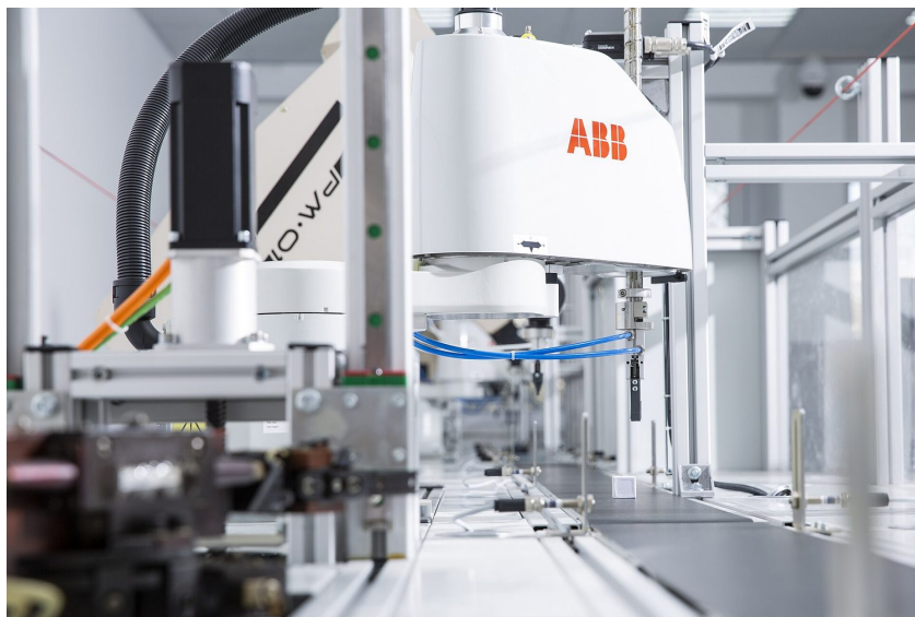
An industrial robot arm. It follows a program and can be reprogrammed to do a new job.