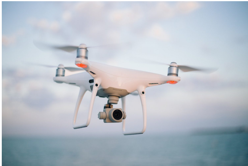
A camera drone: it can fly itself along a set route to collect data

Automated systems are used in many situations, such as industry, transport, agriculture 农业 (farming), weather (gathering data), gaming and lighting.